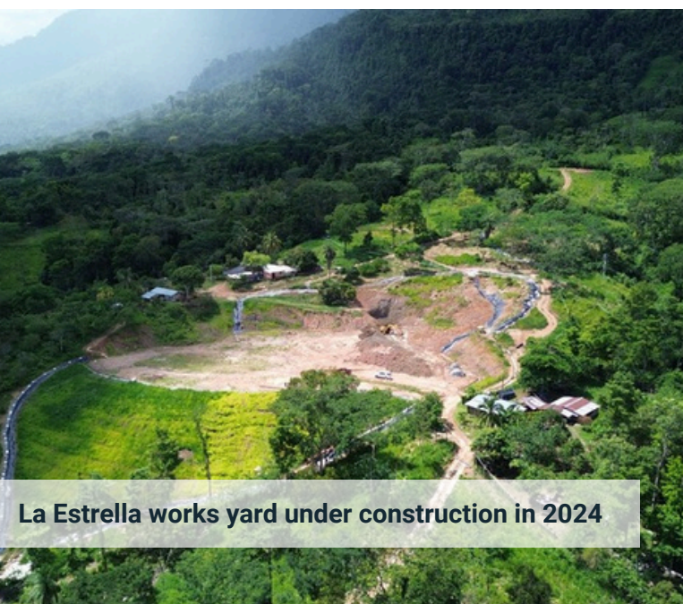
La Estrella works yard under construction in 2024

Underground development is now underway following the completion of the portal for Forge's revenue-generating bulk sampling program. Recent and historical NI 43-101 reports, along with past drill programs, continue to confirm the existence, location, and quality of the coal seams—reinforcing the long-term viability of the project