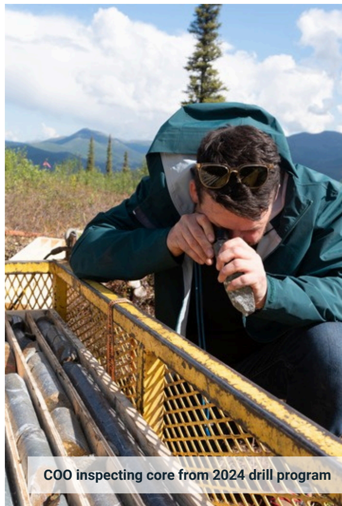
COO inspecting core from 2024 drill program