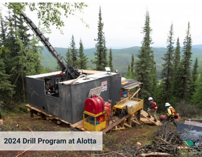
2024 Drill Program at Alotta

99.14 m of 0.30 g/t Au from 62.86 m - 162 m